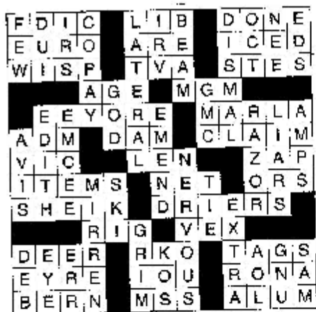
Key for page 9